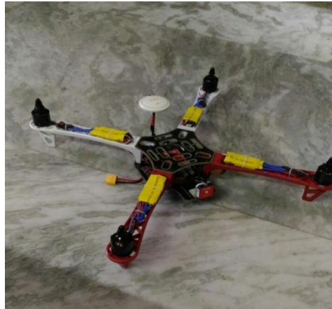
1(b): Drone System